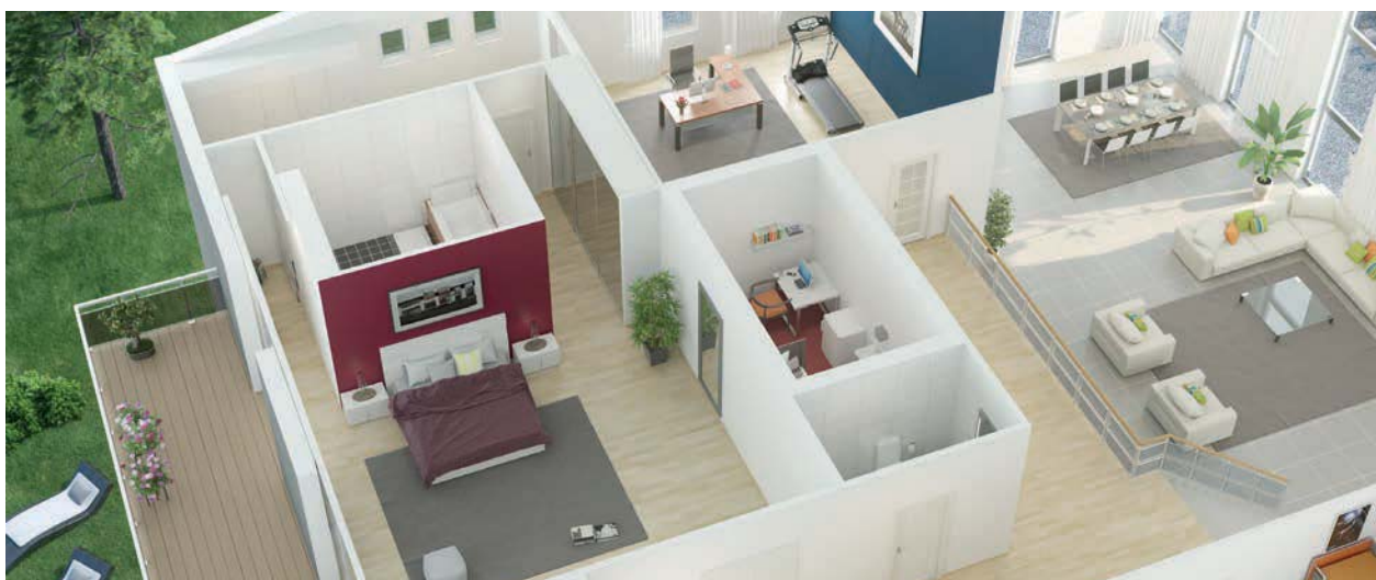
Panic room integration into the apartment.