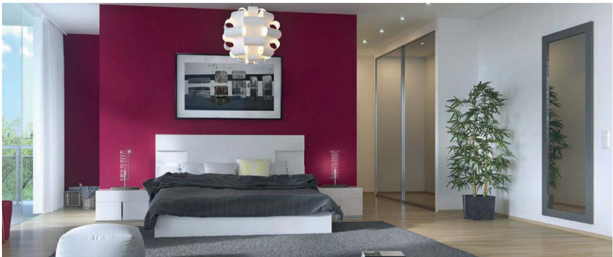
Room view with entrance to the panic room behind the mirror

Safe rooms are typically equipped with basic emergency and survival items such as a flashlight, blankets, a first-aid kit, water, packaged food, self-defense tools, a gas mask, and a simple portable toilet.