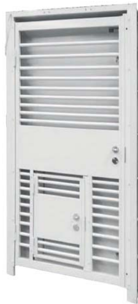
Grill Gate with Integrated Emergency Grill Gate

The emergency doors can be used on their own, installed to concrete wall or as part of prefabricated strongrooms as a secondary access. They can be also integrated to the main vault door for optimising the installation area of the door on the walls and then maximising the storage capacity inside the vault. The outside entrance is also more conveniently arranged. The vault doors with integrated emergency doors are manufactured according to EN 1143-1. The external dimensions and passage/clearance of the vault doors with integrated emergency doors are the same as the standard vault doors without emergency doors.