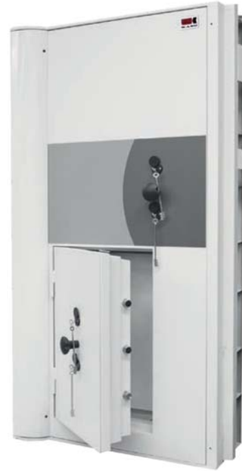
VD-3 Vault Door with Integrated Emergency Door